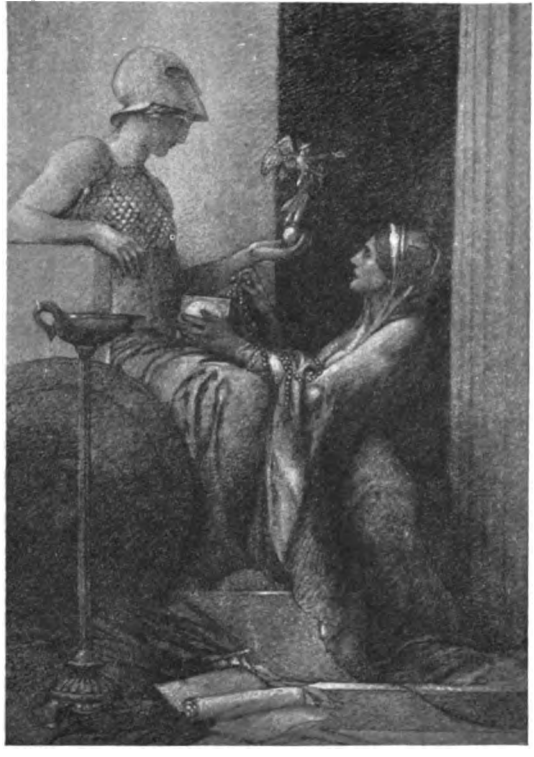
STANFORD VNIVERSITY LIBRARY